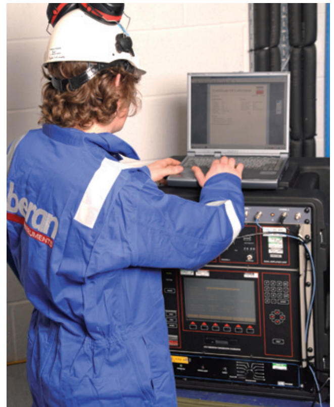
Beran engineers perform on-site calibration and system checks